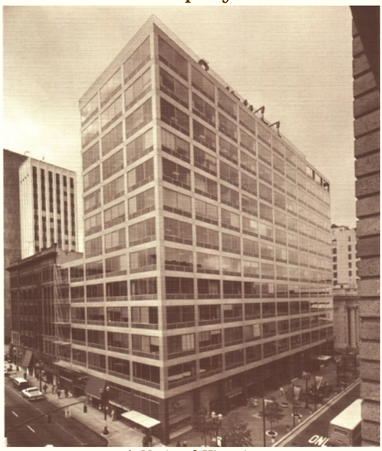
A National Historic Mechanical Engineering Landmark

Dedicated May 8, 1980 in Portland, Oregon