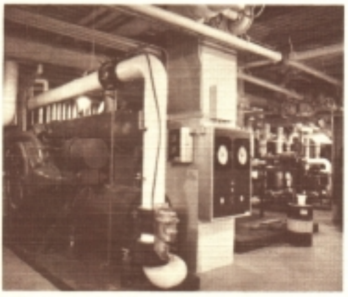
This heat pump, a part of the new installation, has the capacity to run 300 tons of refrigeration. It is one of two heat pumps which heat and _{\rm COOl} the Commonwealth Building. When both pumps are running, the system can handle 700 tons of refrigeration.

During all normal heating weather a supply of by-product heat is available from cooling. Had steam been used for heating, this by-product would have been wasted. The heat pump made its utilization possible. Further,